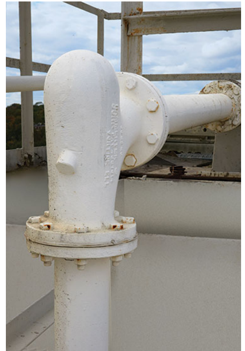
The Smart Elbow® deflection elbow installed in ready-mix plants prevents abrasive materials from impacting the elbow wall, eliminating worn elbows, related downtime and recurring maintenance costs.