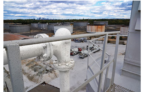
HammerTek short radius deflection elbows eliminated the need to weld or replace failed sweep elbows 100 ft in the air.