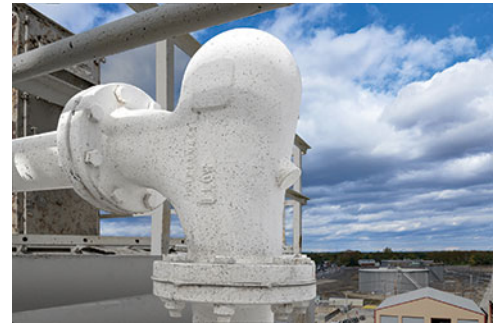
Action Supply, Sharon Hill, PA, eliminated surprise blowouts and associated repair costs after switching to short radius deflection elbows that minimize elbow wear.

Despite the short radius design, material exits the deflection elbow uniformly across the diameter of the outflow, instead of skidding along the outermost wall of the elbow and downstream tubing/pipe. "Even though the vortex area in the elbow where the material rotates has a small radius, the design enhances efficient flow because it creates less head pressure in the pipe," he explains.