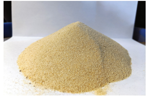
Silica sand, at 60 mesh (250 micron) is pneumatically conveyed from trucks 20 ft (6 m) up into the silo.

"I have another pneumatic system for powdered clay, and if those elbows ever wear through, I will employ the same solution."