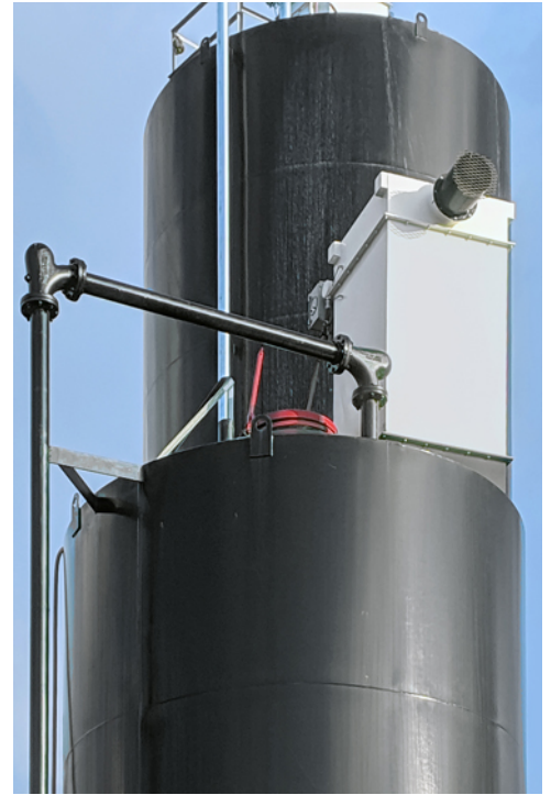
Deflection elbows eliminated abrasive elbow wear, blowouts, labor and downtime related to these two 90° bends.

"In terms of payback, you have the direct expense of materials, your labor and the downtime, but more importantly, you don't have people working 25 feet (7 m) off the ground handling heavy steel pipes," he explains.