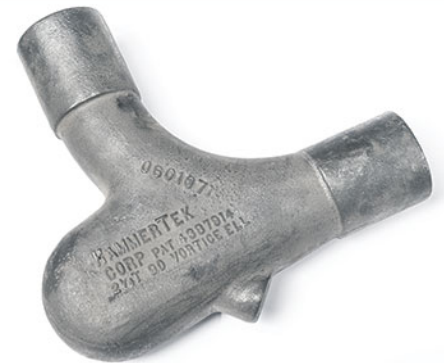
The deflection elbow's short radius, vortex design features a protruding spherical chamber that causes a ball of material suspended in air to rotate, gently deflecting incoming material around the bend without impacting the elbow wall or generating heat.