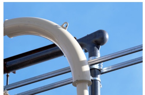
CoorsTek has replaced most of its double-wall sweep elbows (foreground) with Smart Elbow® deflection elbows (rear).