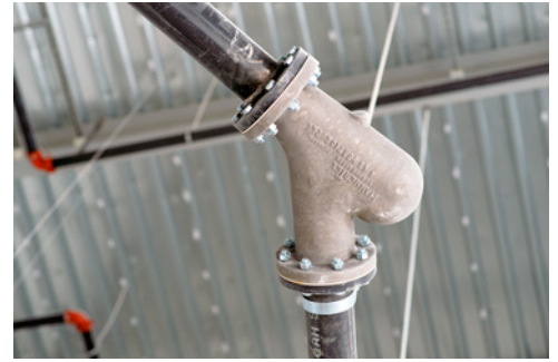
CoorsTek installed Smart Elbow® deflection elbows after experiencing failures of ceramic-lined sweep elbows along its eight pneumatic lines conveying highly abrasive alumina.

Although the deflection elbows are more expensive initially than other styles Harm tried, such as blind-tees, they reduced costs and improved quality. "We get very little wear from the deflection elbows, so we're not wearing off that