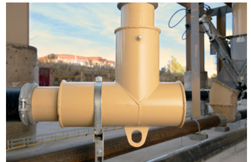
CoorsTek's eight pneumatic conveying lines run between 80 and 300 ft (24 and 91m) in length and 4, 5, and 6 in. (100, 124, 150 mm) in diameter. They transport alumina from railcar unloading to mixing, milling, spray drying and storage.