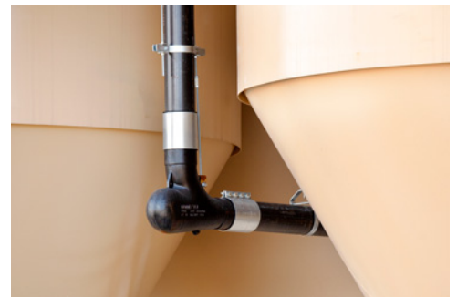
The deflection elbows have reduced pressure drop and prevented contamination, blowouts, and unscheduled downtime.