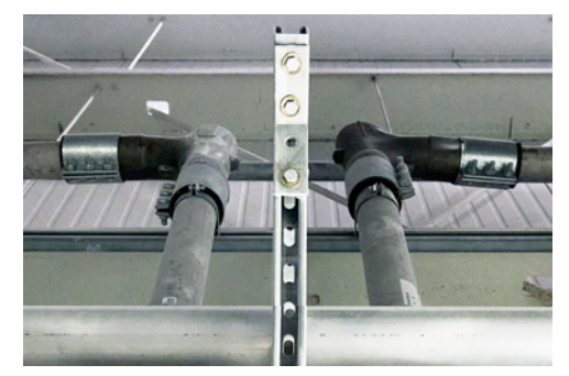
Palram Americas installed Smart Elbow® deflection elbows following abrasion and failure of conventional sweep elbows in PVC conveying lines.