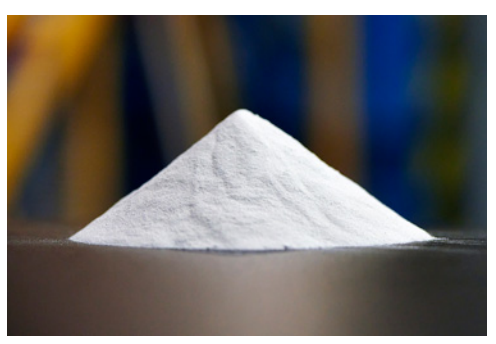
PVC resin abraded conventional sweep elbows, requiring patching or replacement after five months.