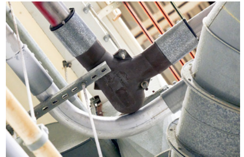
Deflection elbows at Palram Americas stand up to abrasive PVC resins, while sweep elbows handle less abrasive polycarbonate.